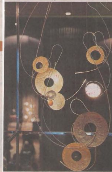
Space Of Happiness by Saprang.

“I wanted to represent happiness by doing what makes me happy. I enjoy crafting accessories and they make me happy. I think other people can feel it, too, when they look at this series of work,” Supot