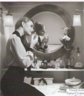
Visual from Tawn's new collection

Tawn's spotless set of Globe-Trotter suitcases: "I have three or four, and I'm eyeing the big one that you can't bring onboard the plane, but how can you get that in ivory? It'll get completely ruined when they put it in the luggage bay!"